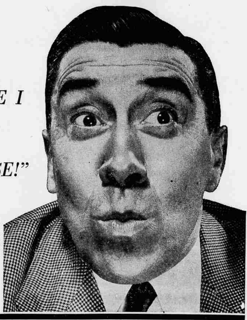
*Photo of French movie-star Fernandel from current best-seller, The Frenchman.

The "FRENCHMAN" says "NEVAIRE HAVE I TASTE SUCH COTTAGE CHEESE!"