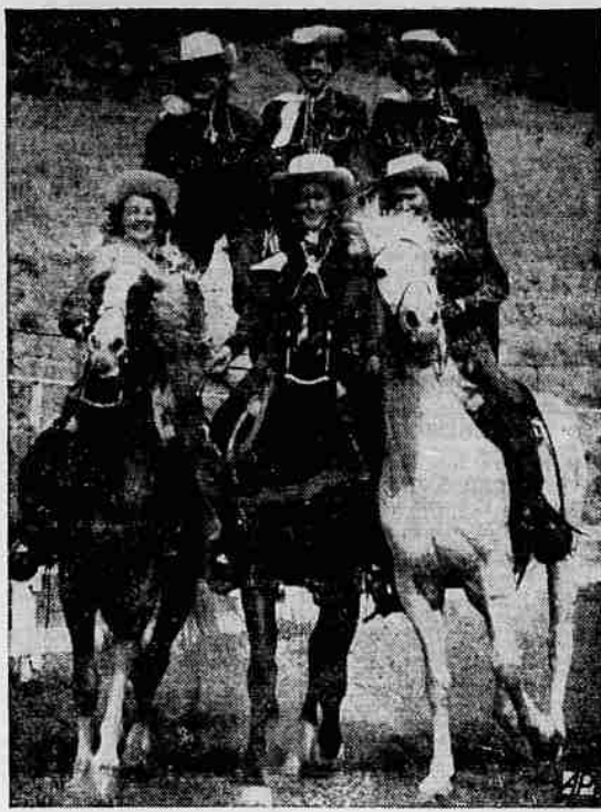
Moving Pyramid—Members of the Valley Rangerettes, prize-winning horsewomen from towns in California's San Fernando Valley, form a pyramid in practice at Van Nuys.

Hollywood, March 14 (AP)—Actress Ann Sheridan took over the title role in the picture "Stella" today after 20th Century-Fox suspended Susan Hay-