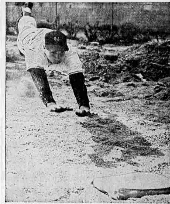
Head First New York Giants outfielder, Bobby Thompson, one of the fastest men in baseball, dives head first for the sack as he tries out the sliding pit during spring training in Phoenix, Ariz.

The tournament will be restricted to age limits which are legal on the stream.