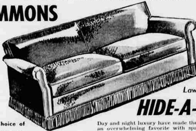
The New Lawson Style