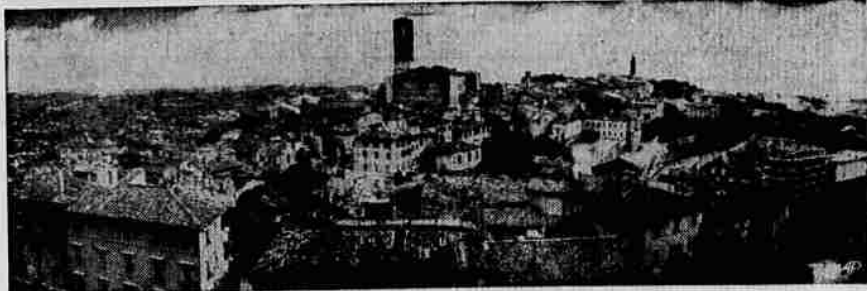
Perugia—It was old centuries ago and stays that way.