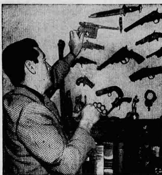
Ex-policeman's Souvenirs—Phil Regan, motion picture actor and singer, who was once a New York policeman, inspects some of his souvenirs at his home in Hollywood.

Top Prices Paid for Your Logs at Burkland Lumber Co. Turner, Ore. Ph. 1125