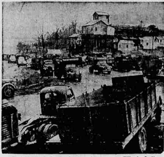
Coal Lineup —Trucks from as far away as Illinois, Indiana and Michigan and numbering as high as 400 line up to be loaded with coal at an operating coal mine in Somerset, O., while 372,000 striking soft coal miners continue their "no contract, no work" policy. United Mine Workers chief, John L. Lewis, and the soft coal operators are reported to be within pennies of an agreement.

Deputy Premier and Foreign Minister Constantin Tsaldaris, leader of the populists, long has been a symbol and target of communist charges that Greece is "monarcho-fascist."