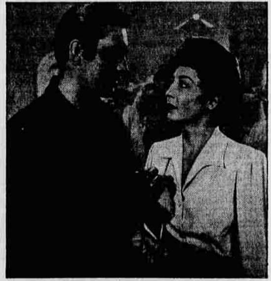
Marie Windsor and her admirer, George Montgomery, in this interlude between action in "Dakota Lil." Rod Cameron co-stars with Miss Windsor in the title role and Montgomery, the hero of the piece, in the leading male part. Cameron, needless to say, is the villain, and the film is due tomorrow at the Grand theater.