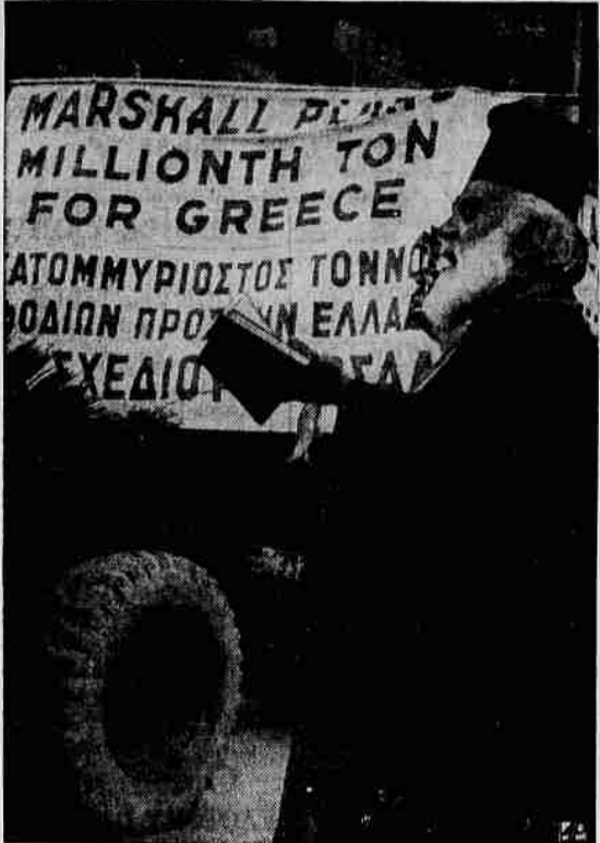
Millionth Ton for Greece—A priest blesses a truckload of American flour, the millionth ton of goods brought to Greece under the Marshall plan, in an Athens street.