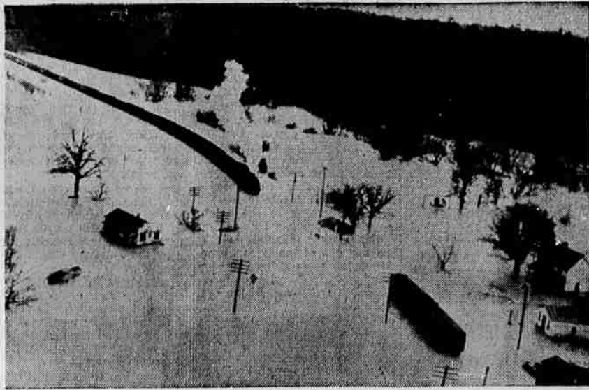
Wet Going—Freight train snakes through floodwaters of the Cumberland river at Kuttawa, Ky. Water is about a foot and a half deep, but both freight and passenger trains continue to use the line.

Mission Field Calls Willamina — The Four Flats quartet, who appeared here several times, has received a call to Korea, Japan, where they will do missionary work.