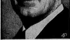
Tasker L. Oddie