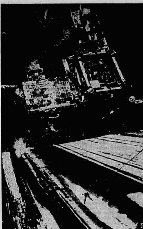
Dam Cleared of Ice—Sonny Clark hangs suspended from a steel cable 300 feet above the Columbia river and hacks at ice three feet thick on face of Grand Coulee, Wash., dam. Ice is being cleared to prevent damage to spillway repair equipment when it is moved into position below. Note chunks of ice hitting water.

Stars Attending School Gervais — Gervais chapter No. 118, Order of the Eastern Star, will hold a school of instruction under the direction of Mrs. Alice Robinson, grand conductress, Saturday evening at 7:30 o'clock.