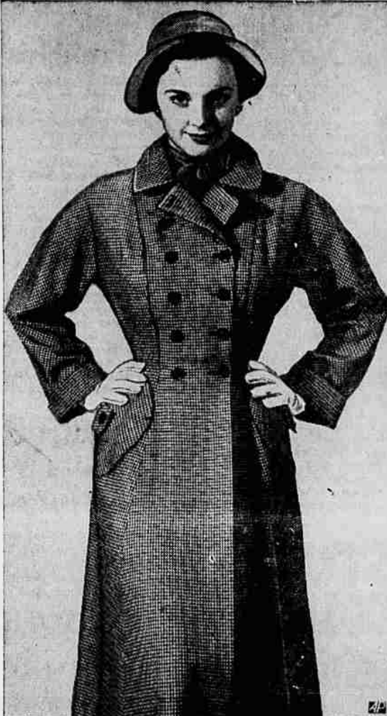
Check This—Checks are top news for spring, as is this slick fitted coat in black and white checked wool. Smooth shoulders, youthful round collar and big half-moon pockets are 1950 notes.