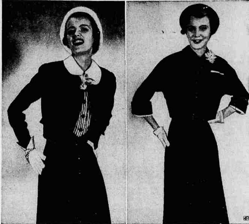
Bolero Suits —These are top of the news for juniors, and here are two examples bound to be seen on well-dressed career girls all over the country this spring. Both are in navy dress-weight wool. The suit at left has high-waisted cummerbund skirt. At right is a slim sheath dress and button-trimmed bolero.