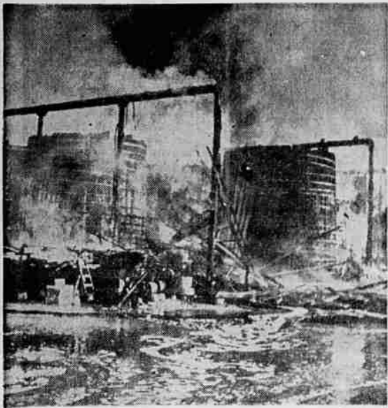
Winery Blaze —Wine flows down the street at height of fire which destroyed the Pioneer Winery at Cucamonga, Calif. One workman perished and 1,500,000 gallons of wine were lost in the million dollar blaze.