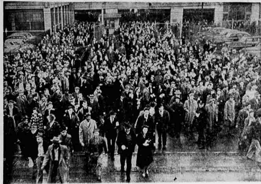
Chrysler Workers Strike—Thousands of workers stream out of the Dodge main plant at Detroit, Mich., as 89,000 automobile workers began a nation-wide strike against the Chrysler corporation. The strike was called when negotiations between the C.I.O. United Auto Workers and Chrysler stalled over pension and welfare benefits.