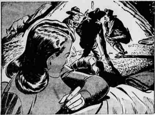
She was suddenly suspicious of the intense attitude of concentration.

By ERLE STANLEY GARDNER (Creator of the famous fictional detective, Perry Mason)