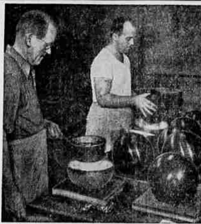
WAX MOLD is made by pouring hot wax into aluminum mold. Over a layer of fabric goes two winds of tough thread. The wax last is removed through an opening that is cut into the fabric after careful separation of the