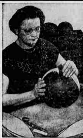
A combination layer of fabric and black rubber is then placed on the threaded surface.