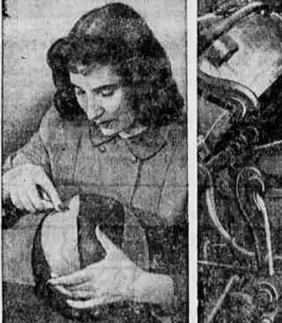
After a molding operation to form the black rubber, leather panels are cemented into place.