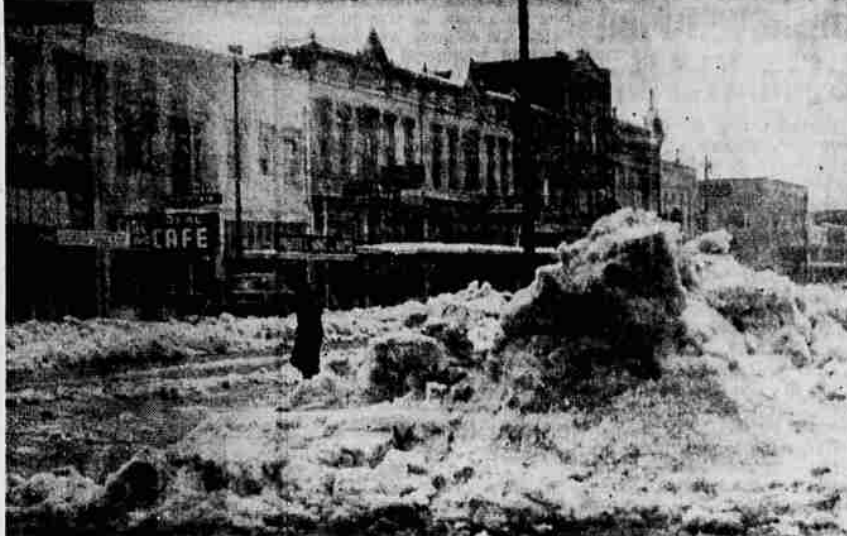
'Snow Foolin' at Dallas—The business district was "liberated" from the heavy snowfall this week when the streets were cleared. Here is how the district appeared Friday afternoon with the snow piled high at the southwest corner of the Polk county court house block.