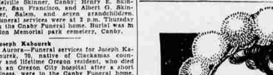
Pompon Baby Set—Knit this adorable bonnet in simple garter stitch using soft pink or blue wool and trim with alternating colored pompons. The cute mittens are worked on two needles for easy knitting. Grandmothers and doting aunts won't want to miss this pretty set. Pattern Envelope No. R2651 contains complete knitting instructions, material requirements, stitch illustrations and finishing directions.