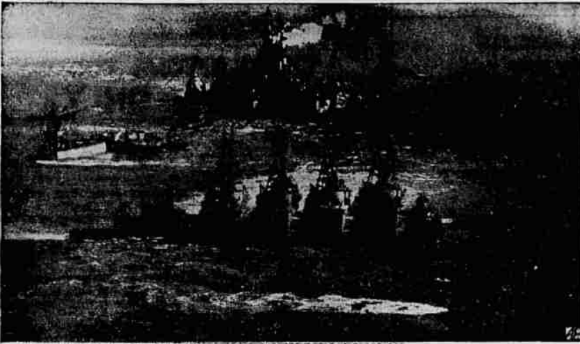
Attempt to Float 'Big Mo'—The combined efforts of 21 tug boats failed to float the battleship Missouri, aground on a mudbank in Chesapeake bay. This airview shows part of the tug boat armada straining to release the giant craft.