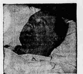
Don't be a slave to vitamin deficiencies! See how B-Complex may help YOU!