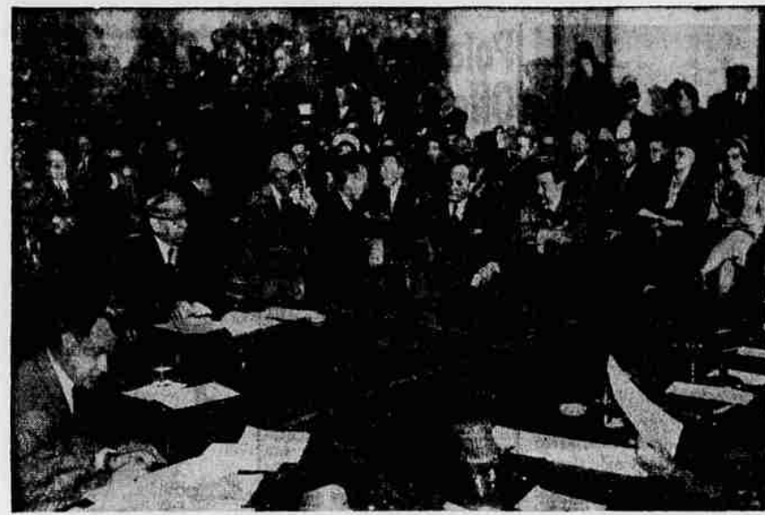
'Dry' Leader Testifies—Bishop Wilbur E. Hammaker (left-center, behind microphones) of the Methodist Board of Temperance speaks for "dry" forces in a senate commerce committee hearing on legislation which would bar liquor advertising in interstate commerce and over the radio. Standing room was at a premium in the big senate office building caucus room at Washington, D. C.

Hamburg, Jan. 18 (AP)—Do you eat ice cream, or do you drink it? You might think the answer is you eat it, unless it has melted and you are scooping up the last drops from the bottom of the dish. But here in Hamburg it is not so easy as that. The best legal brains of the city are wrestling with the problem and there are $250,000 at stake. Two years ago the city fathers decided that ice cream was a drink and thus liable to the beverage tax. Nobody bothered much about it then because German money was almost worthless and there wasn't much ice cream anyway. But now that the reformed currency has real value, people are counting every pfennig. pealed reichslaw (state law). The city council should voted twice—once to repeal the old law and once to approve the new. The city council is going to remedy that omission by voting on the matter again. They also are taking the case to a third and higher court. The million marks in the dispute are the taxes already collected by the city on ice cream sales. The hard-up city treasury is reluctant to part with them. Anyway, argues the treasury, who would get the money back, if the tax finally is ruled illegal? All the people who bought ice cream in the last two years? Impossible, says the treasury. The ice cream dealers? That would be unfair, the treasury contends, since they did not pay the money in the first place, but merely collected it from the