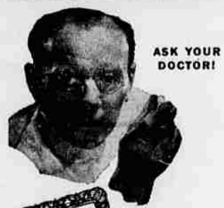
ASK YOUR DOCTOR!