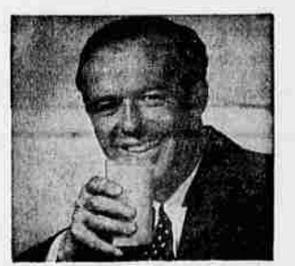
Thousands are discovering the "Rybutol" way is the better way to guard against the danger of vitamin deficiencies!