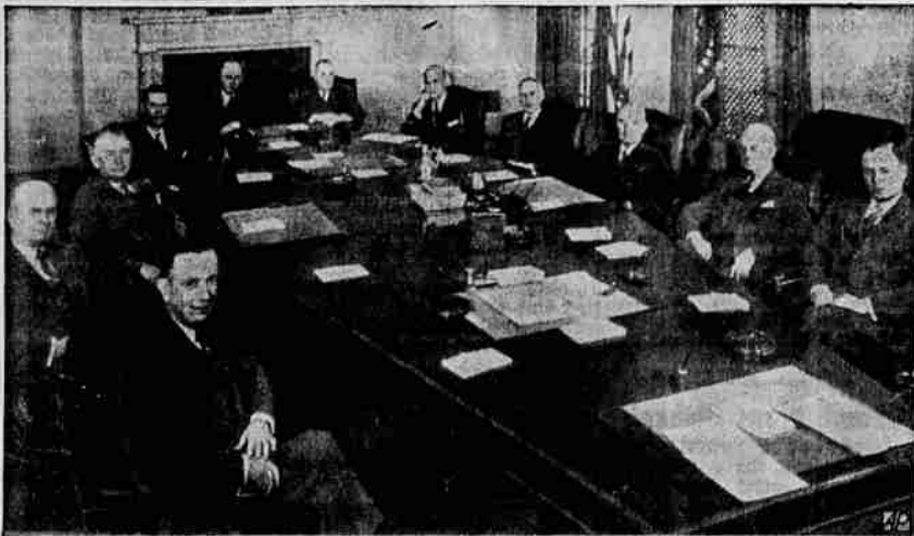
President and Cabinet—President Truman (third from right) poses at the White House with members of his cabinet before a regular session of the group. Clockwise around the table are Interior Secretary Oscar Chapman, Commerce Secretary Charles Sawyer, Vice President Alben W. Barkley, Labor Secretary Maurice J. Tobin, Agriculture Secretary Charles Brannan, Postmaster General Jesse Donaldson, Defense Secretary Louis Johnson, Secretary of State Dean Acheson, President Truman, Treasury Secretary John W. Snyder, and Attorney General J. Howard McGrath.