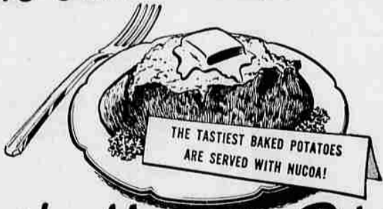
THE TASTIEST BAKED POTATOES ARE SERVED WITH NUCOA!