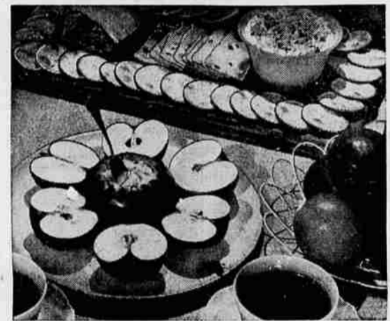
Apple and Cheese Spread—Dessert Specialty

AF Newsletters Make use of the late-harvested Winesap, now available in good supply. An all-purpose apple, it's delicious baked, in cooked dishes, or just as is for dessert. The Winesap also has the advantage of being an excellent keeper. For dessert serve the apples with an assortment of cheese. I like to mix a bowl of cottage cheese to go with the crunchy fruit. Cream (sweet or sour) and walnuts, pecans, or filberts go well with it; so do slivers of dates and preserved ginger and pineapple. Or add a little lemon rind, lemon juice, sugar, and a few raisins, or spice up the bland creamy cheese with cinnamon and nutmeg. It's fun to make your own combinations. And here's a ham and apple dish that's good pickings for lunch or supper.