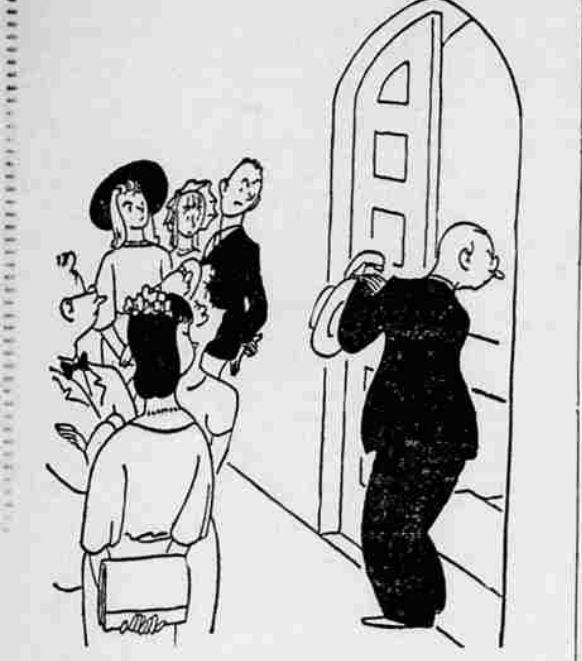
... Stood in small groups glaring at Mr. Banks.

By EDWARD STREETER. Illustrated by Gluyas Williams