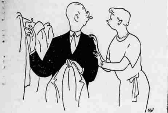
Mr. Banks stared at her in amazement.

By EDWARD STREETER. Illustrated by Gluyas Williams