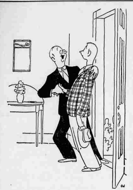
He now received them with open-armed cordiality.

By EDWARD STREETER. Illustrated by Gluyas Williams