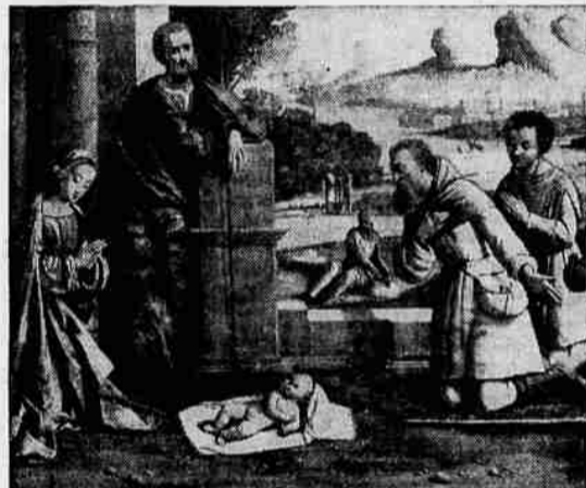
ADORATION OF THE SHEPHERDS: Garofalo (16th Century) —"And it came to pass, as the angels were gone away from them into heaven, the shepherds... came with haste, and found Mary, and Joseph, and the babe lying in a manger."