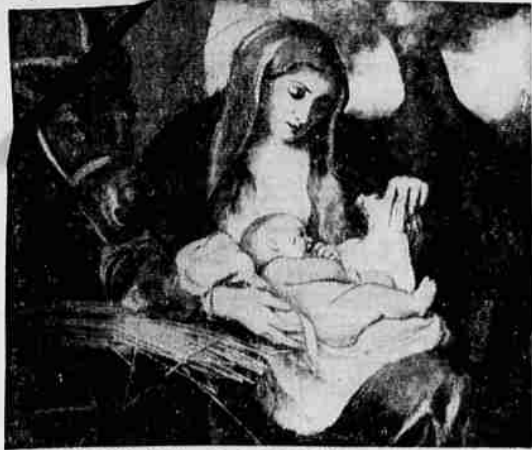
THE NATIVITY: Van Dyck (1599-1641) —"And she brought forth her firstborn son, and wrapped him in swaddling clothes, and laid him in a manger; because there was no room for them in the inn."