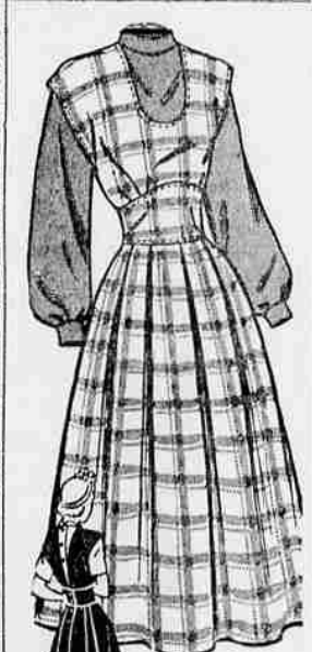
2899 SIZES 8 - 14