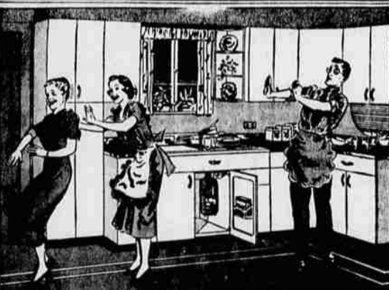
Let's imagine this gorgeous Youngstown Kitchen is yours! You'll need no garbage pail, for the 48" twin-bowl Kitchenaider cabinet sink shown is equipped with a Mullinaider electric garbage disposer. Ask us about the low monthly payments.