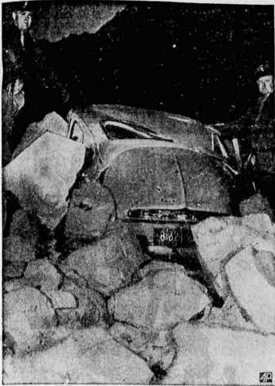
Rock Slide Smashes Car —Henry Alfred Waldref, 47, of Grand Junction, Colo., was killed and three persons were injured when a slide of several thousand tons of rock crushed the car in which they were riding near Thistle, Utah. The slide occurred in Spanish Fork canyon on U. S. highway 50 between Provo and Price, Utah.