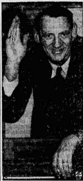
Royal Farewell —King Fredrik, of Denmark (above) waves as he leaves by train from Liverpool street station, London, en route home after a visit in the British capital.