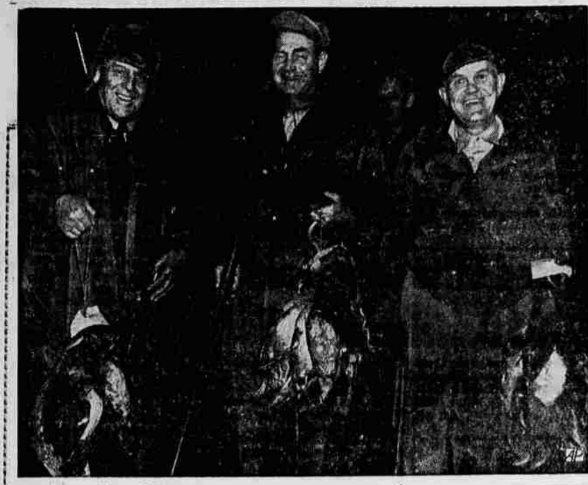
Operation 'Quack' Lt. Gen. Clarence R. Huebner, Gen. Thomas T. Handy and Lt. Gen. John K. Cannon, (left to right) of U. S. forces in Europe, return from duck hunt near Bremerhaven.