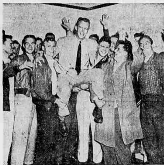
Coach of the Year Charles (Bud) Wilkinson, 34-year-old pilot of the unbeaten, Sugar Bowl-bound Oklahoma university Sooners, is hoisted into the air by his team in Norman after he was named the "coach of the year" by the American Football Coaches association in a poll conducted by the Scripps-Howard newspapers. He polled 102 first place votes out of 332 ballots.

"Honor" system basketball has been played elsewhere with good results in spite of doubts expressed before the play was tried.