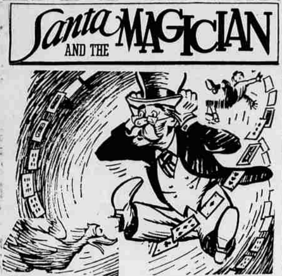
They slid into each other and around each other until man and boy and duck were dizzy

(Chapter 5) MAGIC ROUTE TO SANTA LAND "Gladys Hady!" exclaimed Serena when she saw what was in the dwarf's brief case.