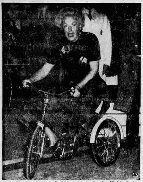
Cycling in Circles-British actress Gracie Fields looks amazed as she tries out tricycle at London cycle show.