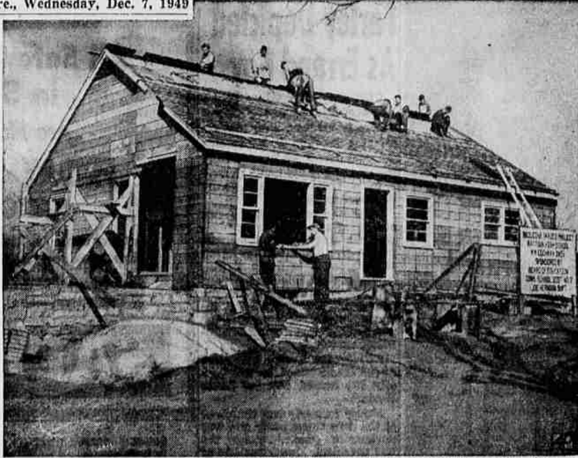
Student Project—Students in the building trades class of Raytown, Mo., high school, work on the six-room house with garage they are building as part of their class work.