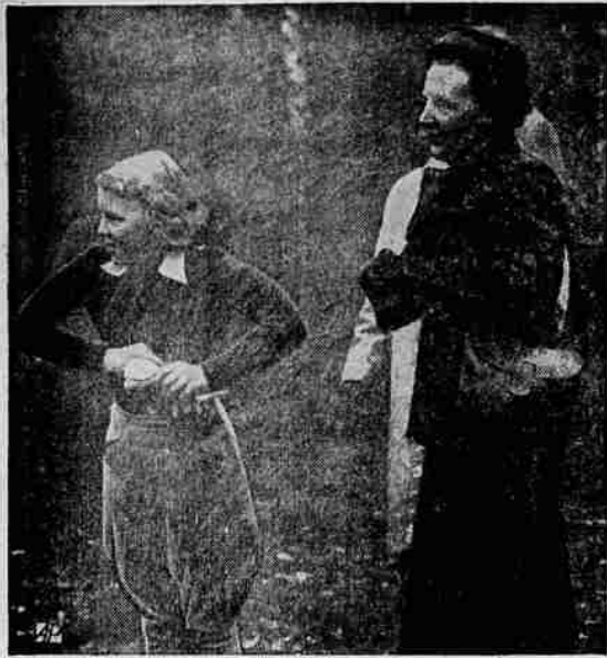
At Royal Hunt—Queen Juliana of The Netherlands, and her daughter, Princess Beatrix, 11, watch Princess Irene, 10, ride in her first hunt at Spengenberg castle, Haarle, East Holland.