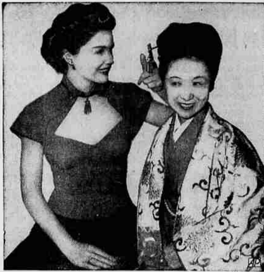
East and West Meet—Esther Williams, motion picture star, admires a hair ornament worn by Kinuyo Tanaka, first lady of the Japanese screen, during a luncheon to the Oriental actress in Hollywood on a tour of United States.