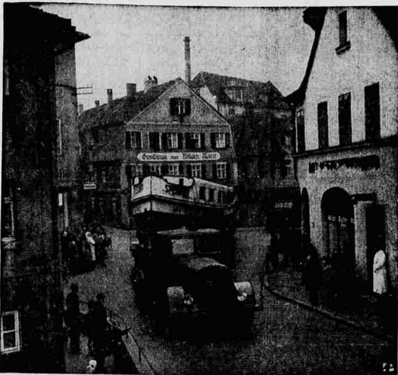
Homebound, Overland —The 86-foot motor ship "Spessart" is carried through Ansbach, Germany, to her home waters on Main river because usual course was dried up by bombs.