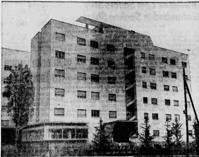
Italian 'House Hotel'—This "house hotel" built by Milan has separate sections for men and women. A room, rented three years ago for $5 monthly, now costs $20.