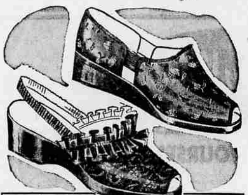
LUXURIOUS RAYON SATIN SLIPPERS

Still puzzled about what to give her? Either pair of these will salve your problem! Both are colorfully embroidered, both have supple leather soles. In blue or black, sizes from 4-9.