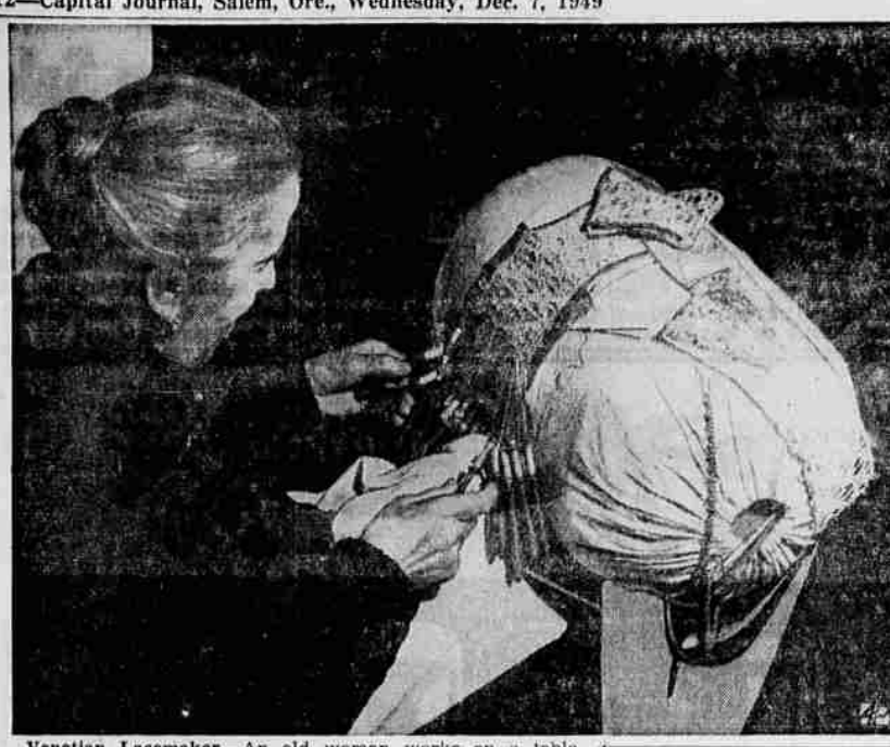
Venetian Lacemaker—An old woman works on a table centerpiece in old Byzantine design at Venice's Jusurun school where some of the famous modern laces are produced.