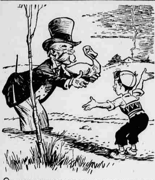
OUT CAME A SKINNY, DUSTY, ANGRY LOOKING DUCK