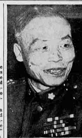
Li Tsung-Jen, president of the Chinese Nationalist government.

Seattle, Dec. 6 (AP)—Southeast storm warnings were ordered along the Washington and Oregon coasts at 9 a. m. today, southward to Cape Blanco.