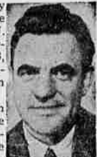
General John J. Pershing

J.J.P. called an aide to his bedside at Walter Reed hospital and dictated: