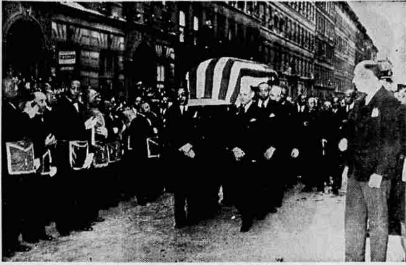
Bojangles Laid to Rest —Members of Masonic order stand in silent tribute (left) as the body of Bill (Bojangles) Robinson is borne to the Abyssinian Baptist church in New York. About 30,000 persons—the small and the great—crowded around and into the church to pay their last respects to the famed Negro dancer.