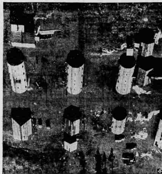
Air View of geometric patterns that look like silos and odd shaped towers. Now turn the picture upside down. The silos turn out to be Quonset huts. It's a view of Burnt Creek, iron mine project between Labrador and Quebec. (AP News-features)

Modern pins made of wire were first produced in France and Germany.