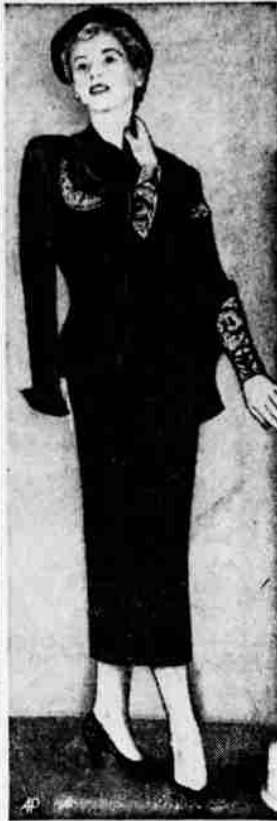
Strictly Elegant—Slim dress and jacket in sheer brown wool with bronze bulge bead trim.

serve them with French fried potatoes and red and green cabbage salad.