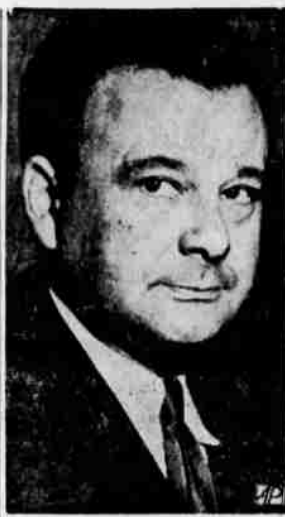
Trial Judge —Federal Judge George B. Harris (above) of San Francisco, is presiding at perjury trial of Harry Bridges charged with swearing falsely he was not a member of the communist party in 1945 when he obtained his citizenship.