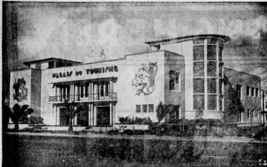
EXPOSITION BUILDING —This is the newly built Palace of Tourism on Haiti Exposition grounds at Port-au-Prince, the capital. Building will house tourist headquarters after Dec. 8 exposition opening marking the capital's 200th anniversary.