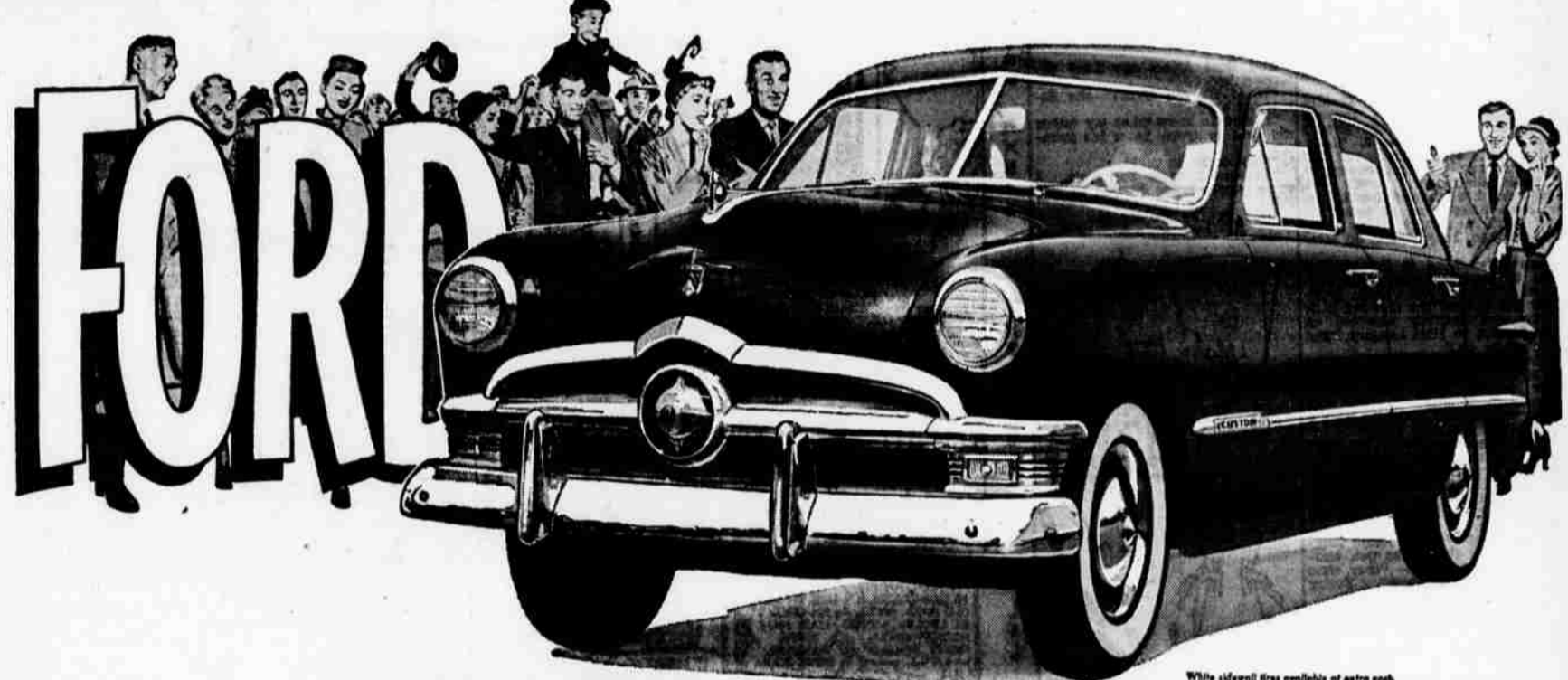
White sidewall tires available on extra cost.