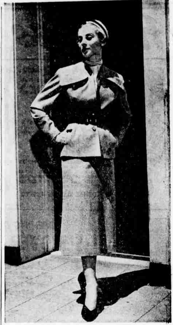
Pockets With a Flare accent shoulder line-mark a new high in Hughes afternoon suit. Jacket has cardigan closing with duet of jeweled buttons at mirdiff, more pocket interest at the side-this time opening horizontally. Belt is asphalt gray with gold trimmed buckle. Skirt is match-slim.

Buyer of the better dresses. She studied designing in Chi-cago and entered the fashion field as an associate of Strand Fashions of that city, where she joined the Hughes stores eight years ago.