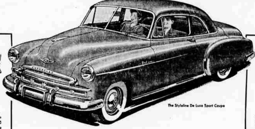
The Stylized De Luxe Sport Coupe

Only one low-priced car brings you all these EXTRA VALUES