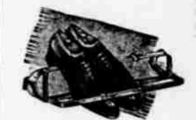
KV-4 Shine over, keeps doors clean, neat, and off the closet floor. Adjustable from 78" to 30".

Keep your closets so neat they practically hand out your clothes Solve your closet problems the simple, inexpensive way—install K-Veniences. They double closet capacity, save cleaning and pressing bills, and permanently convert your cluttered, outmoded closets into smart, modern dressing units. There's nothing like K-Veniences for closet conversions.