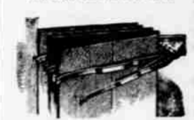
KV-550 Four swinging arm clothes to keep the press in skirts and pants.